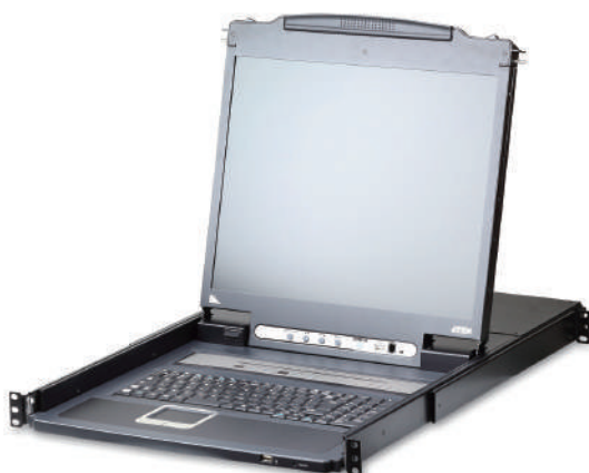
CL5716I Front View