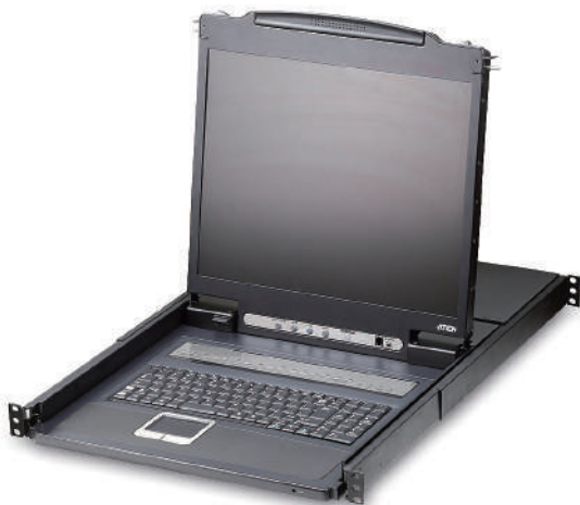
CL1316 Front view