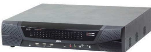
KN8164V Front View