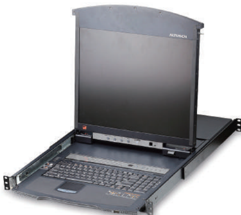
● KL1516Ai Front view