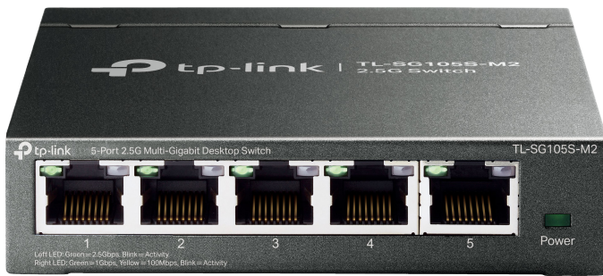
5× 100Mbps/1Gbps/2.5Gbps Ports