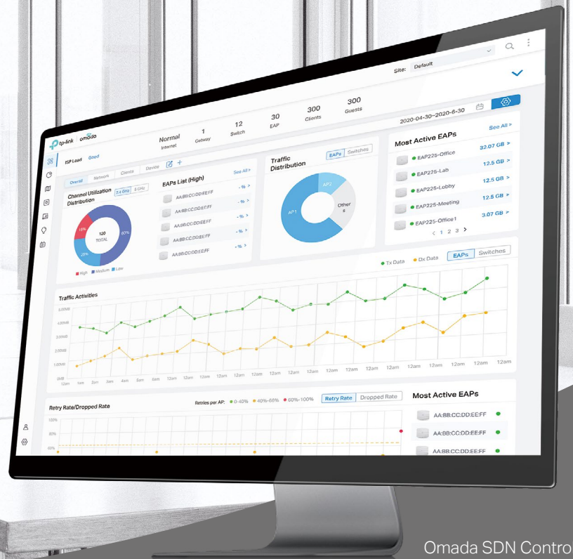
Omada SDN Controller