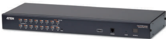
KH1516Ai Front View