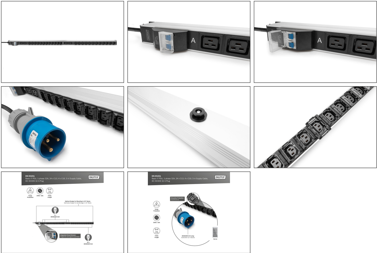
DN-95451 Basic IT PDU, 1-phase 32A, 24 x C13, 4 x C19, 3 m Supply Cable, IEC 60320 C13 A Plug