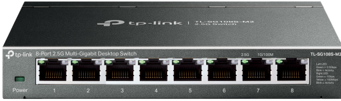
8× 100Mbps/1Gbps/2.5Gbps Ports