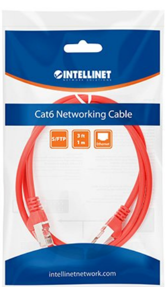
Model Shown: #736145